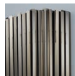
Polished black nickel