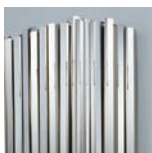
Polished stainless steel